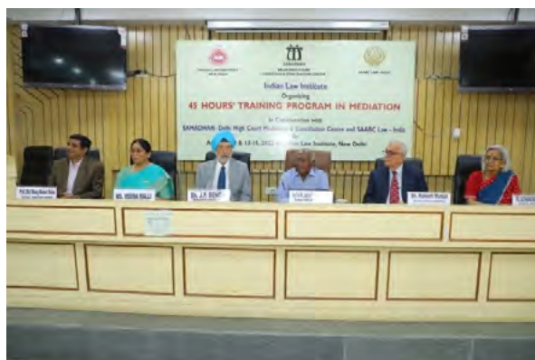
Dignitaries at the training programme