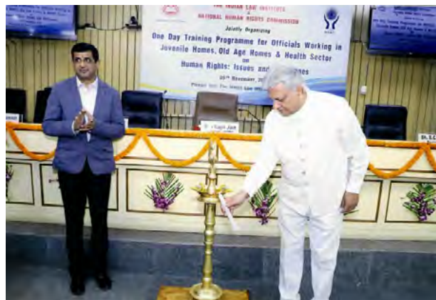
Snippets from the Training Programme