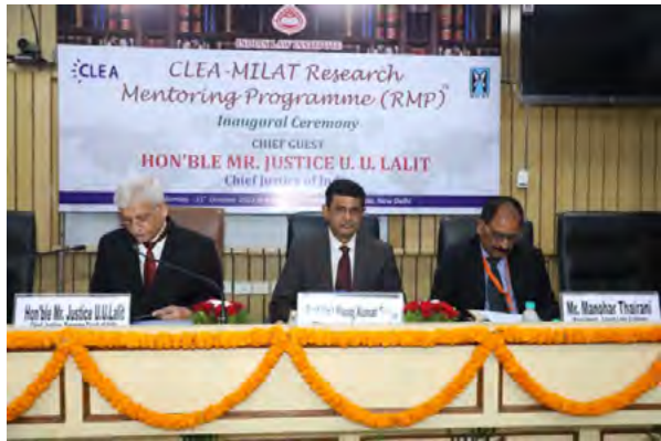
Snippets from the Programme