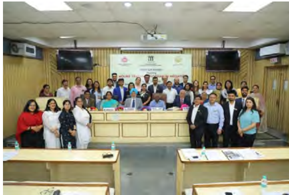
Participants of the training programme along with dignitaries

The Indian Law Institute has launched a three months Certificate Course on the eve of Azadi Ka Amrit Mahotsav (AKAM) on Comparative Constitutional and Public Law on May 4, 2022 and the programme will end on August 10, 2022. The Course involves 75 hours of teaching (35-40 lectures) between 5 – 8 p.m. on various themes in Online Mode.