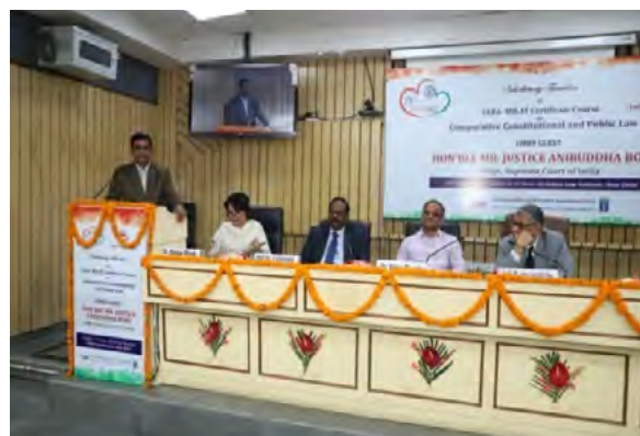
Snippets from the Course