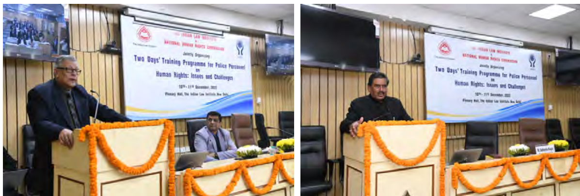
Snippets from the Training Programme

The Indian Law Institute in collaboration with National Human Rights Commission organized a two-day program for Police personnel on Human Rights: Issues and Challenges. The training program aimed at sensitizing police officials to the nuances of the human rights framework and the due process guarantees. The Training Programme was inaugurated by Hon'ble Dr. Justice Mukundakam Sharma, Former Judge, Supreme Court of India. Over these 2 days, the participants critically engaged with the relationship of the policing system with myriad concerns like investigative procedures, national security, media impact, and the protection of women and children. The sessions primarily focussed on the way constitutional and human rights order should shape policing practices.