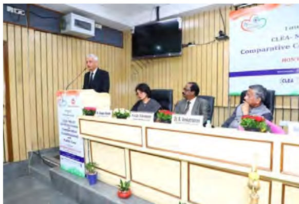
Hon'ble Mr. Justice U.U. Lalit, Judge, Supreme Court of India addressing the participants