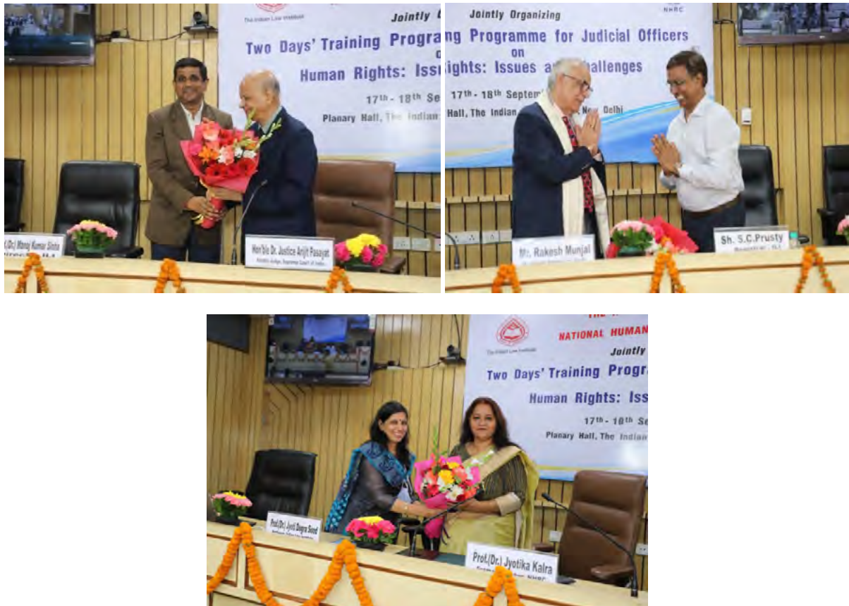
Snippets from the Training Programme

registration process in the NHRC website. If FIR is not registered in a case, a citizen has the option to approach NHRC. A dedicated scrutiny division function to resolve the grievances of the citizens. The scrutiny division decides the actions and the reports. The member at NHRC is assisted by a Presenting officer who is former Additional districts judge to ensure a smooth and hassle-free mechanism. The drafting of proceedings is done by them. She also elaborated on the procedure followed by NHRC to approach courts and get enforceable orders. The commission is expected to go to the court to get its orders enforceable.